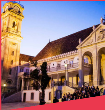
University of Coimbra and the Joanine Library