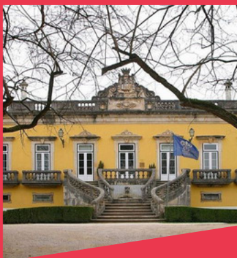
Quinta das Lágrimas