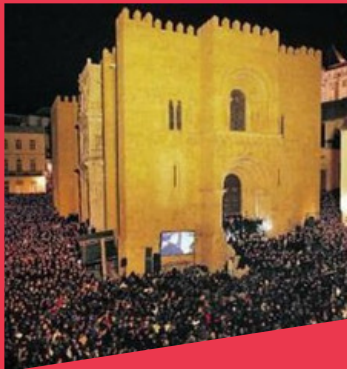
Queima das Fitas festivities (especially the Serenata Monumental)