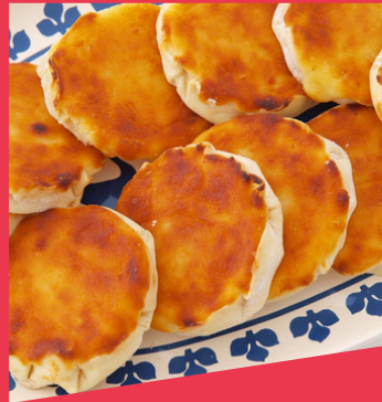
Queijadinha de Pereira