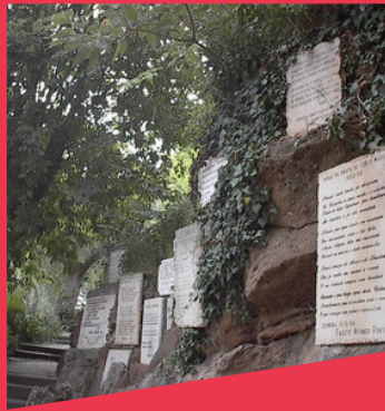
Penedo da Saudade